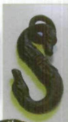
Swan head belt buckle.