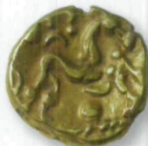
Ambiani gold stater.