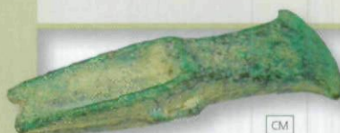
Bronze Age looped palstave axe head.