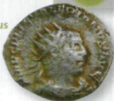
Herennius Etruscus coin.