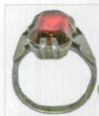
Silver finger ring.