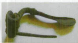
Roman bow brooch.