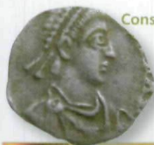
Constantine siliqua .