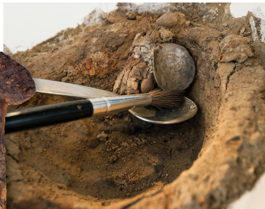
Viking shield boss containing remains of leather purse