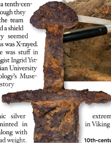
10th-century Viking sword